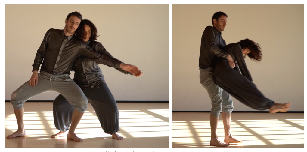
Film Stills from The WorkRoom in Milan, Italy

During this period we got rid of all the props, after much deliberation. I also cut most of the unison parts. Luckily we did not work with the props in rehearsal too much so that when we did ultimately drop them it was not problematic. What is intriguing about this central issue is that the props were central in creating much of the movement in my initial process in Bogliasco, but the paring down allowed the choreography to be more distilled and potent.