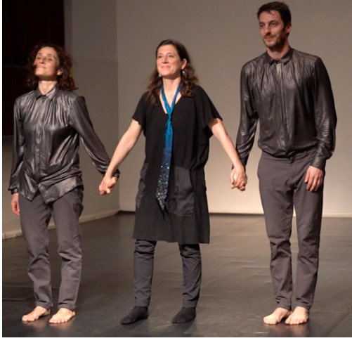
Film Stills from Armor Amour work-in-progress showing in Milan, Italy

April 1 – end of semester: worked with the students on campus on film shorts using the footage