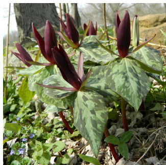
Sessile Trillium (Trillium sessile)