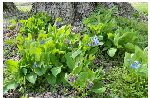
Virginia Bluebells (Mertensia virginica)