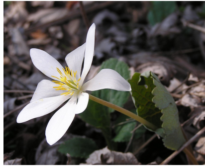
Bloodroot ( Sanguinaria canadensis )