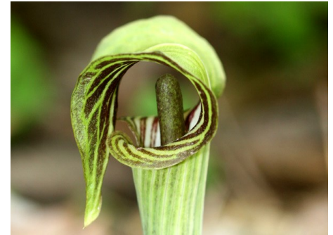
Jack-in-the-pulpit ( Arisaema triphyllum )