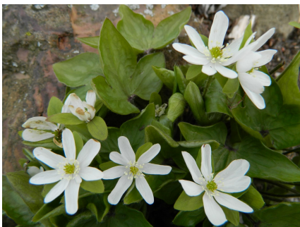
Sharp-lobed Hepatica (Hepatica nobilis var. acuta)