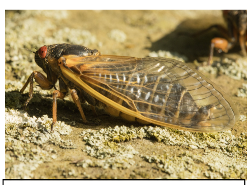
See you in 17 years, buddy!