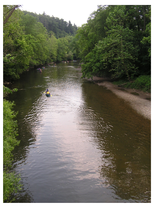
Continued on page 3

Scenic river staff work to protect these extraordinary rivers in a number of ways. Since forested riparian zones are so essential to maintaining river health, ODNR has acquired land and conservation easements along rivers. The terms of conservation easements can vary, but