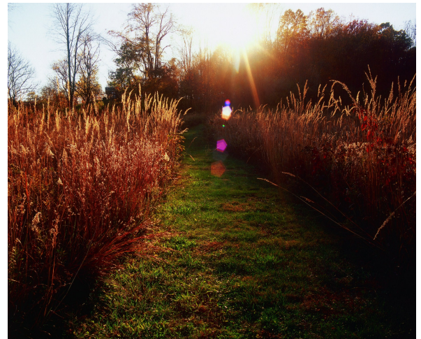
The BFEC prairie is at its height in fall months.

Learn to find your way in the wilderness with map reading skills, direction finding, and compass reading skills. Suitable for ages 10 and up. This program is sponsored by the Kenyon Athletics Department. Space is limited; to register, email heithause@kenyon.edu . ...at the end of the workshop (at 4pm), you can participate in an informal ROGAINE-style orienteering race! You'll have 60 minutes to collect stamps from as many checkpoints as possible and make it back to the finish line. There's no course- you'll use your new map and compass skills to navigate. Bushwhacking is allowed, so wear sturdy shoes and pants. Winners will get small prizes!