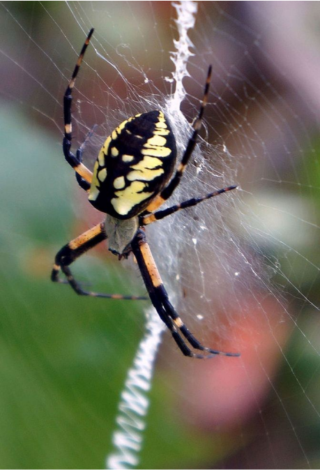
Black and yellow garden spider.

prominent zig-zag of silk in the middle.