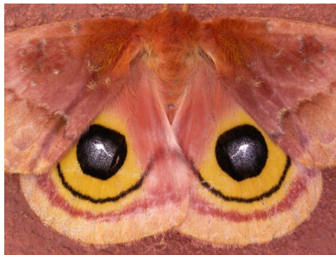
Io moth, ( Automeris io), Io moth caterpillar