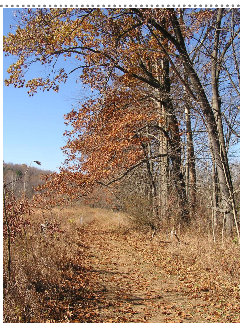
More swamp white oak trees will join those planting in the late 90's between the BFEC river trail and the Kokosing Gap Trail.

Finally, on the leased agricultural field off of Laymon Road, we'll be undertaking our most ambitious restoration project of the year. Another three acres of prairie and an oak grove boasting seventeen tree species will be installed this fall! Over the next three years we will work to reclaim the rest of the field with scientific and habitat plots that with showcase a number of Ohio and regional forest types; one more venue for recreation and research at the BFEC! Look for more on this project in our next newsletter.