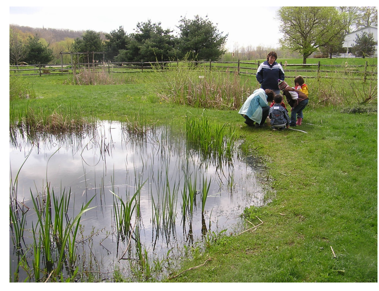
Not only is being in nature fun and full of "sticky" learning, it may be the antidote to what ails a large proportion of children and adults.

In early elementary years, students learn about adaptations of plants and animals that allow them to survive in their habitats. But to actually feel a tadpole's soft skin, which can absorb oxygen during its months of hibernation submerged in mud, or witness the chiseling work of a woodpecker's extraordinary beak firsthand helps cement the concept firmly in children's minds. As one child put