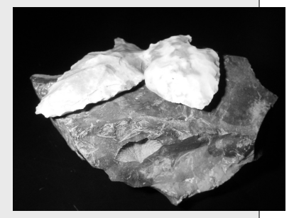
Flint found in in Knox County. The brachidpod fossil in the middle of the large chunk is evidence of its oceanic origins.

Regardless of where it came from, ancient people discovered that this hard, brittle stone could be adapted into a dizzying array of points and tools for hunting, warfare or daily life. Millions of objects have been crafted from flint over many thousands of years. These objects, these rocks, all tell a share of the human story; of adventure, conflict and innovation, and how a small, soft creature was able to conquer the globe from pole to pole.