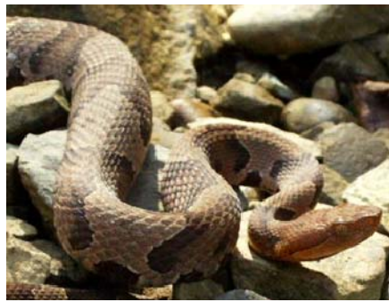
The Northern Water Snake (left) is sometimes misidentified as a Copperhead (right). The chances of seeing an actual Copperhead in Knox County are extremely slim - a verified sighting has not occurred since the 1970's.

Knox County was once home to vast tracts of old growth forest and many animals that no longer roam the countryside, like wolves, mountain lions, bison, elk, and the Northern Copperhead.