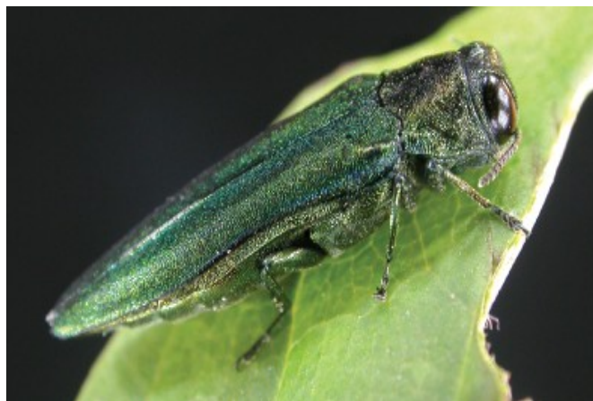
Adult Emerald Ash Borer.

For additional information visit: www.emeraldashborer.info