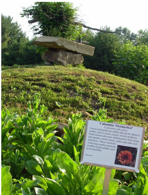
New signage provides detailed information for visitors to the Wildlife or Medicinal Gardens.

As we discussed in last summer's newsletter, biting off only what you can chew is one of the hardest and most important lesson a gardener must learn. The value of focus we've learned from the Wildlife Garden has spread to