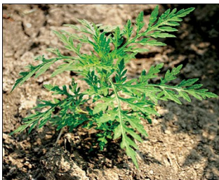
Ragweed = sneeze-worthy

Routinely blamed for causing hay fever, goldenrod is in fact innocent on all counts. Its sticky pollen is transported chiefly by insects, not the wind as is the case with allergy-inspiring pollen. Less than 2% of wind-born summer pollen comes from goldenrod. When your allergies act up this year, consider placing blame on another plant: ragweed.