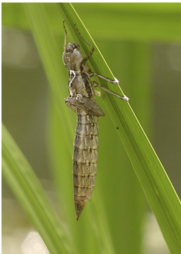
A discarded larval exoskeleton.