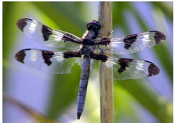
A Twelve-Spotted Skimmer rests on a cattail.

Skimmers and other dragonflies differ from their small cousins the damselflies in that they cannot fold their wings over their backs. When they land their wings are extended out to the side. This exposes the entire wing surface to the sun and provides an efficient way for them to warm their flight muscles.