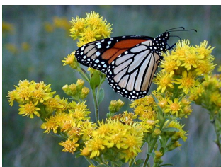
Goldenrod = non-allergenic

For many, fields in summer bloom bring no joy. Waves of golden flowers conjure not poetry but the names of allergists and antihistamines. While we would never make light of the discomfort caused by seasonal allergy symptoms, we do feel it important to make a stand for an oft and incorrectly-maligned plant: goldenrod.