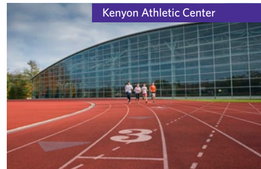
Kenyon Athletic Center